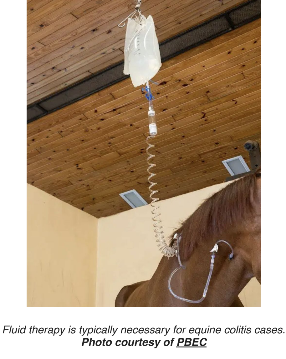
It's no secret that in nearly any medical condition, early diagnosis can lead to a better prognosis — and colitis in horses is no exception. The inflammation of the colon that defines colitis can be fatal, although fortunately, with the proper

detection of symptoms and immediate treatment, a positive outcome and